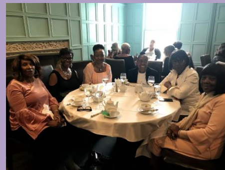
The Friends of PRH enjoyed High Tea and Tour.

Akwaaba Bed and Breakfast Inn in the Poconos.